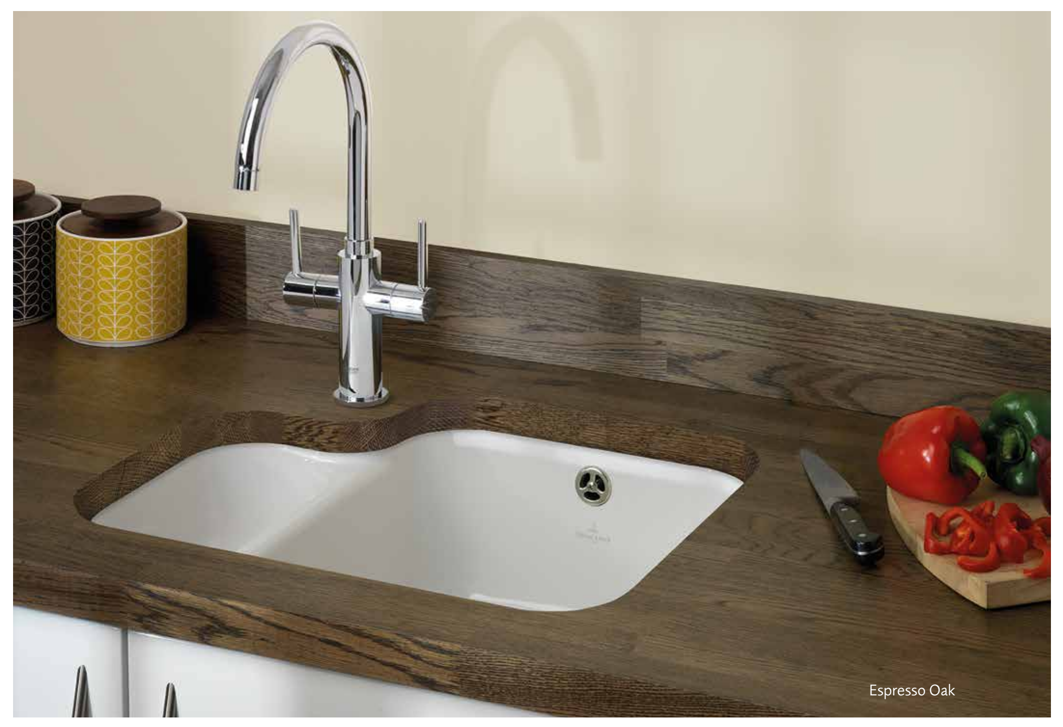
Tuscan solid wood worksurfaces